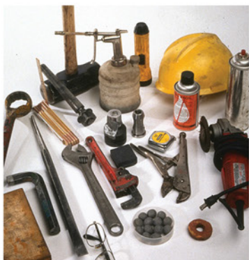
JAWS 2.0 can find and retrieve almost any dropped object!