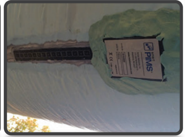
matPIMS™ 1x15 array permanently installed using viscoelastic putty to overcoat sensor strip and head before wrapping/backfill.