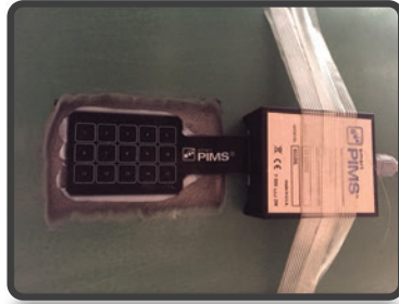
matPIMS™ 3x5 matrix permanently installed with RS-485 cable back to surface for data collection, pre-overwrap.