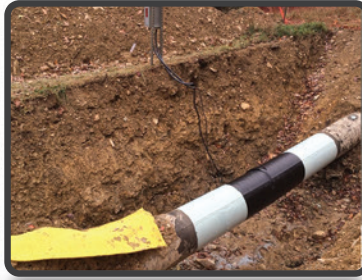
Fully coated and wrapped installation with RS-485 cable mounted in test station for data collection.